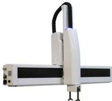
XZ Theta PP100 with gripper